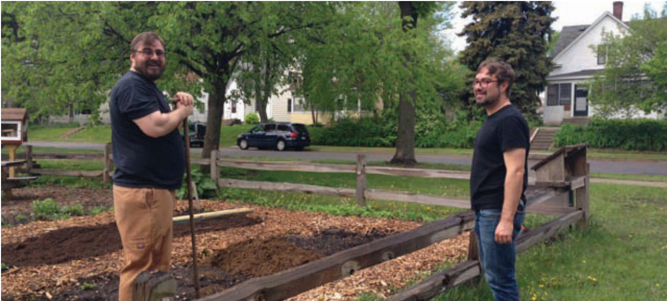
Below Photo: Gardeners prepping their plots for planting