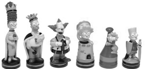
Queen King Knight Rook Pawn Bishop

When I was about six or seven years old my Grandpa taught me how to play chess. For those of you who have gone through this, the hardest part is just remembering which way the pieces move, and in the case of a pawn, attack. I have played against my dad (a lot) Out of about 50 games I would say I’ve won 4. So clearly, my dad is better than I am at chess. (Though he reminds me he has a 50-year jump on me). For my birthday I got a Simpsons chess set. Each of the family members is featured along with Krusty the Clown.