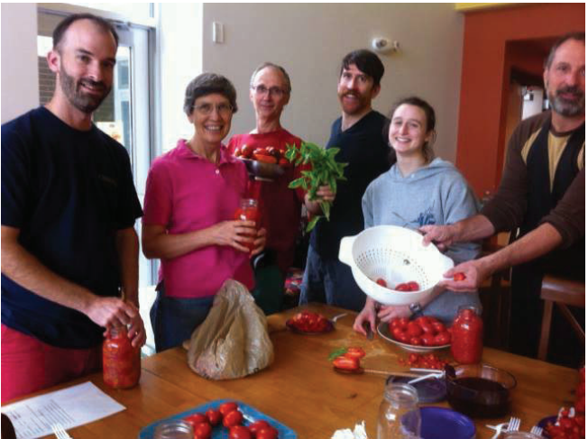
A couple of Corcoran Grows activities & events

Corcoran GROWS supports this proposal. And it is being considered and discussed also at CNO. Corcoran GROWS is a group of concerned neighbors working to build a resilient neighborhood to transition from an extraction-based economy to a restorative, local economy that values community connections and knowledge.