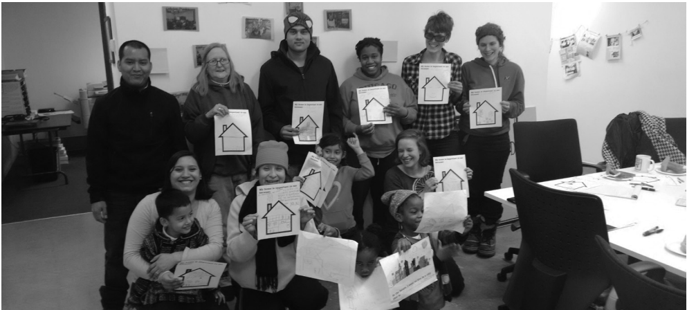
Renter’s Committee members gather to discuss the lawsuit against QT Properties and other renter issues in the neighborhood.