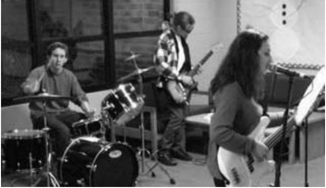
Corcoran Park youth rock band