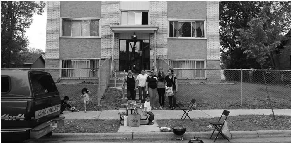
Residents standing in front of 3021 Longfellow