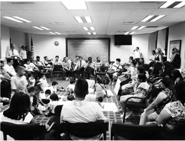
At a renters & city meeting tenants address habitability issues, retaliation, and gentrification.

I suggest to our readers new to this issue to see this under a new light. Imagine if a certain credit score was required in order to shop at a certain type of grocery store. Now imagine if you could only access stores where the produce bins were lined with mold, and cockroaches creep out as you pick an item off the shelf. Then, you call the city and they tell you that your stores where you shop are ranked as their most sanitary businesses and that they are alleging that they are handling the matter at an appropriate pace. Even if the city were to shut down these businesses, no policy is in place to make sure that you have access to an alternative grocery store within your qualifying tier. Meanwhile some of the same grocery owners are building a new series of grocery stores for another class of consumers with better credit, and who incidentally happen to predominantly share the same skin color. For the sake of