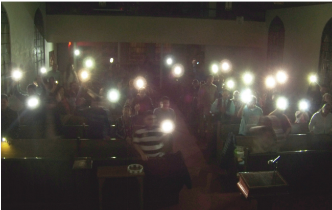
above: "Is this an André Rieu concert? No. It's church!" Members of Lirio de los Valles wave their phones for light.