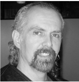
"I paint not by sight but by faith. Faith gives you sight." -Amos Ferguson

The way we start our day can make or break us. When I awake in the morning and open my eyes, I also open my heart, mind and spirit with an "Attitude of Gratitude," thanking my Higher Power for another day of life. Regardless of what might be happening in my life, this is my law of self-care.