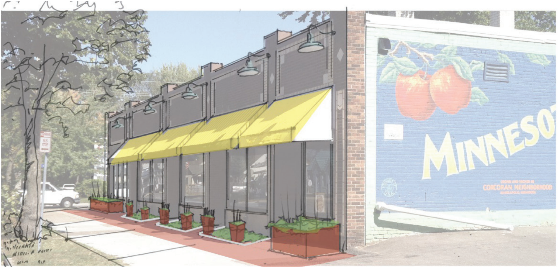
CORNER STORE IMPROVEMENTS