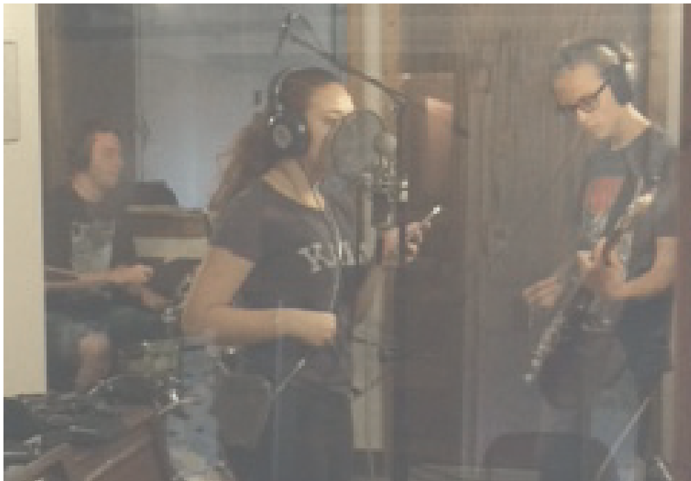
The Corcoran Park Band, Parks and Wreck, are in the midst of recording an album! Here they are recording at a local studio.