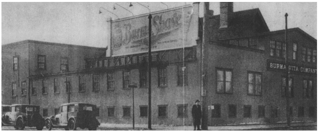
2019 East Lake Burma Shave Building in 1929 above & today below

Thank you Corcoran neighbors, and CNO, for your interest in the history of the building at 2019 East Lake Street built in 1882 as Vine Congregational Church on 23rd Avenue South, and moved to its present site in 1892. A hearing before the Historic Preservation Commission has been scheduled for 4:30pm, Tuesday October 25th, in room 317, Minneapolis City