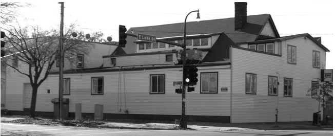
2019 East Lake Burma SHave Building today and in the 1900's below

and 33rd St. in 1911, (now Vine Evangelical), 2019 E. Lake became Hugnad Hall, a Scandinavian meeting place for I. S. W. (International Scandinavian Workers). By 1917, it had become a woman owned manufacturer of bonnets, aprons, and ladies furnishings (Winget Mfg). In 1925, Burma Shave started their phenomenal success with signs and shaving cream. This is our Corcoran history, folks! This building, which has heroically championed recycling/repurposing, and has escaped the wrecking ball for 134 years, should again be repurposed, like the Hopkins Train Depot, as a student run history/coffee shop/event center. The issues and history of immigration, which are once again current events, and broadly represented in the South High student body, will be given a forum grounded in our neighborhood by a student led museum of history. Thank you for your consideration of our city's and neighborhood's history.